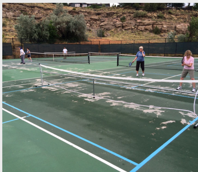
Pineridge Courts 2014